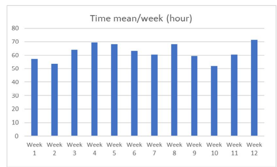
Fig.2 - Average time spent per week, Stage 1

After the process that is divided into two stages, wherein the first moment (Stage 1) the XML Importer was not used, and in the second moment (Stage 2) that is characterized by the implementation of the software, a comparison was made between the stages, taking into account the time it took for the product data to be updated in the system and the time spent after its implantation.